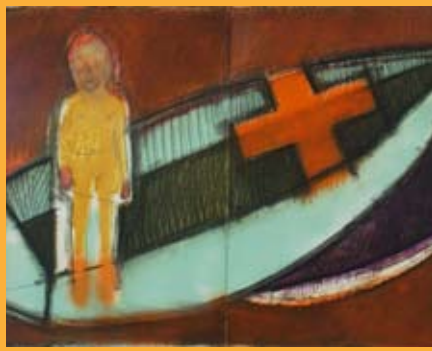
Boats Will Float and Bumble Bees Will Sting Jerry Allen Gilmore June 6 – June 24, 2013 Gallery Celebration: June 20, 5 - 7pm Steffl Gallery