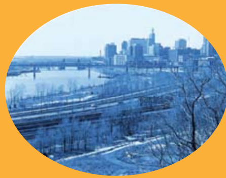
Revisiting Twain’s Mississippi New Photographs by Chris Faust July 1 – September 8, 2013 Steffl Gallery